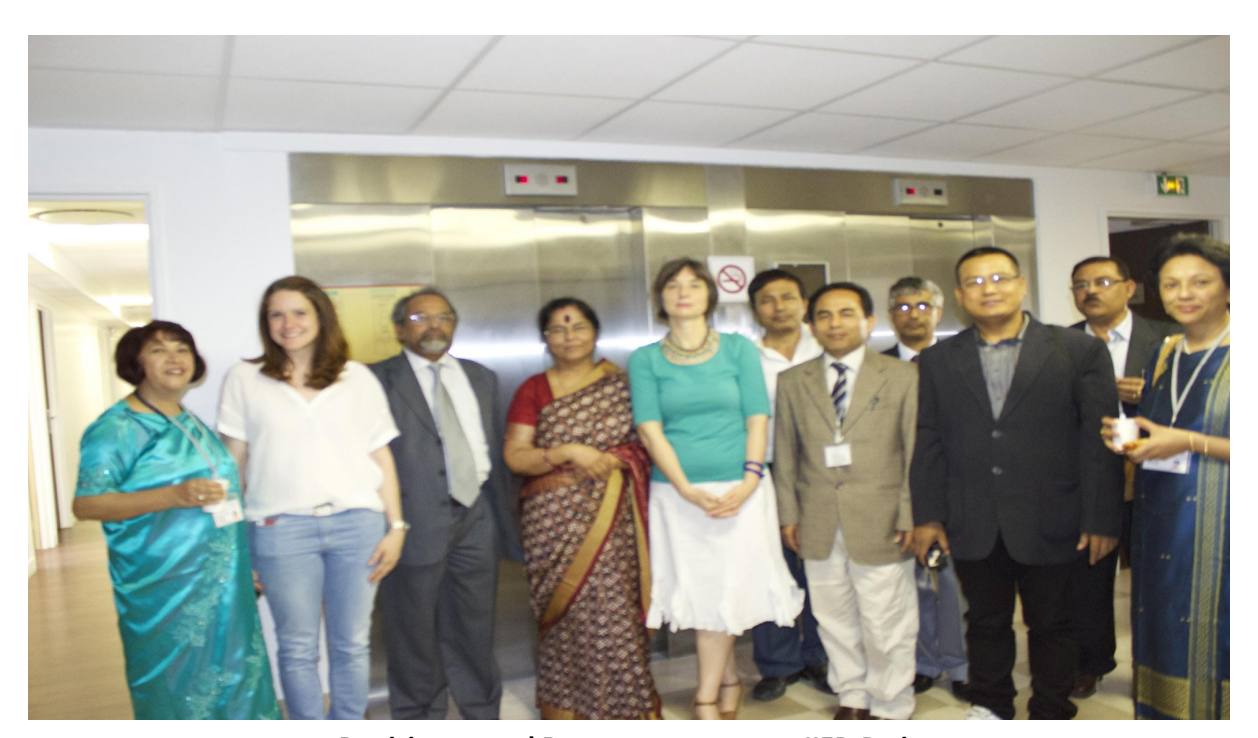
Participants and Resources persons at IIEP, Paris