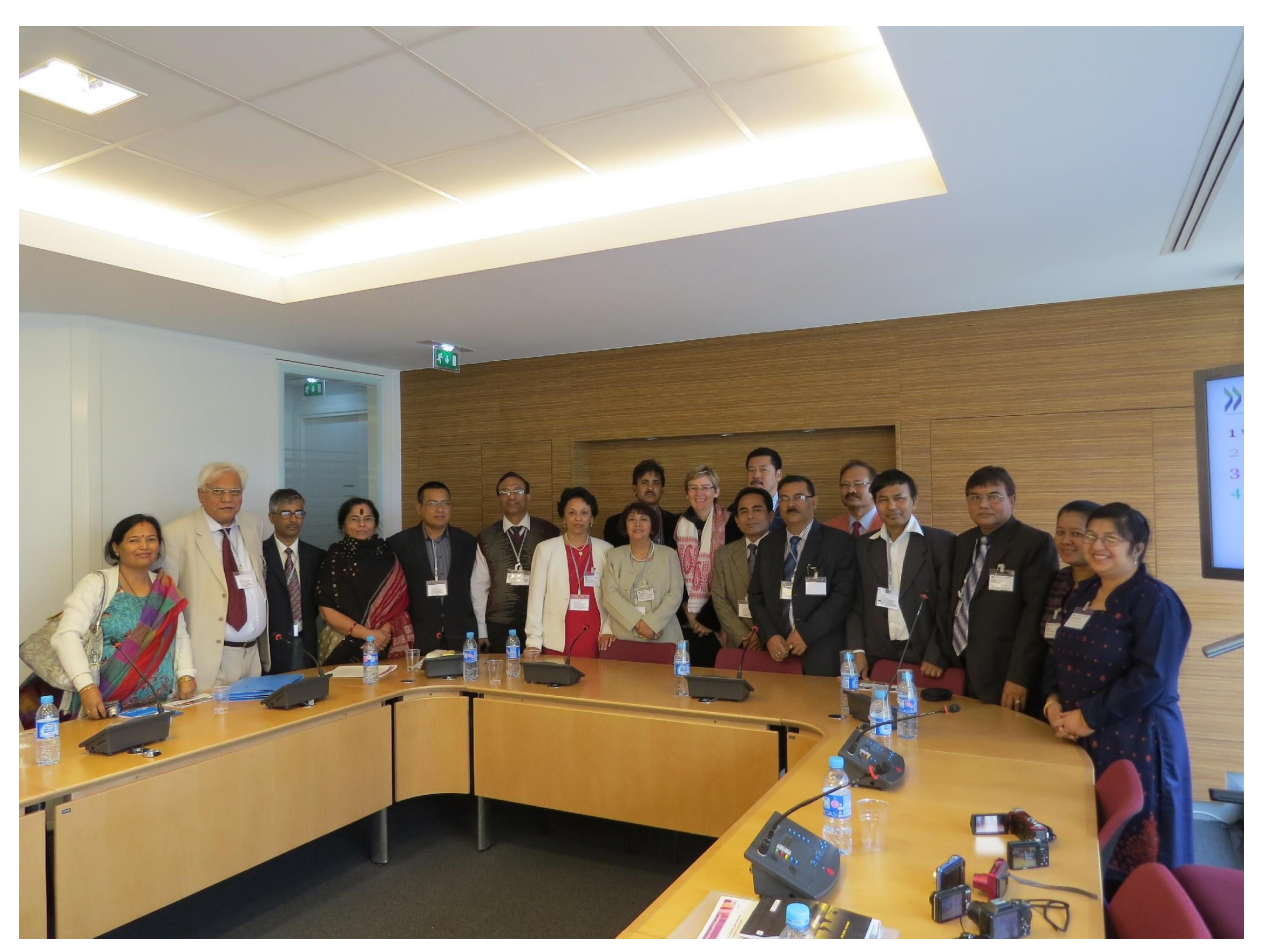
Participants and resources persons with expert from OECD at OECD Office