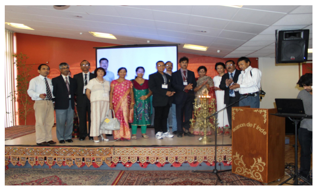
Participants and resource person in anauguration of programme